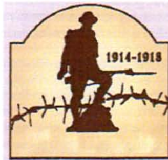
iconic picture of a WWI soldier