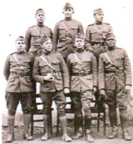
African-American soldiers circa 1917